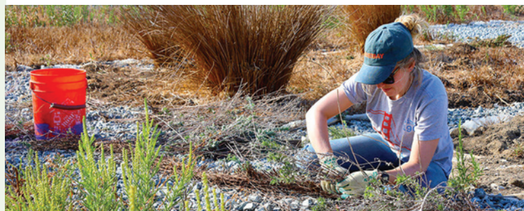
Native plants being relocated by a Save The Bay volunteer