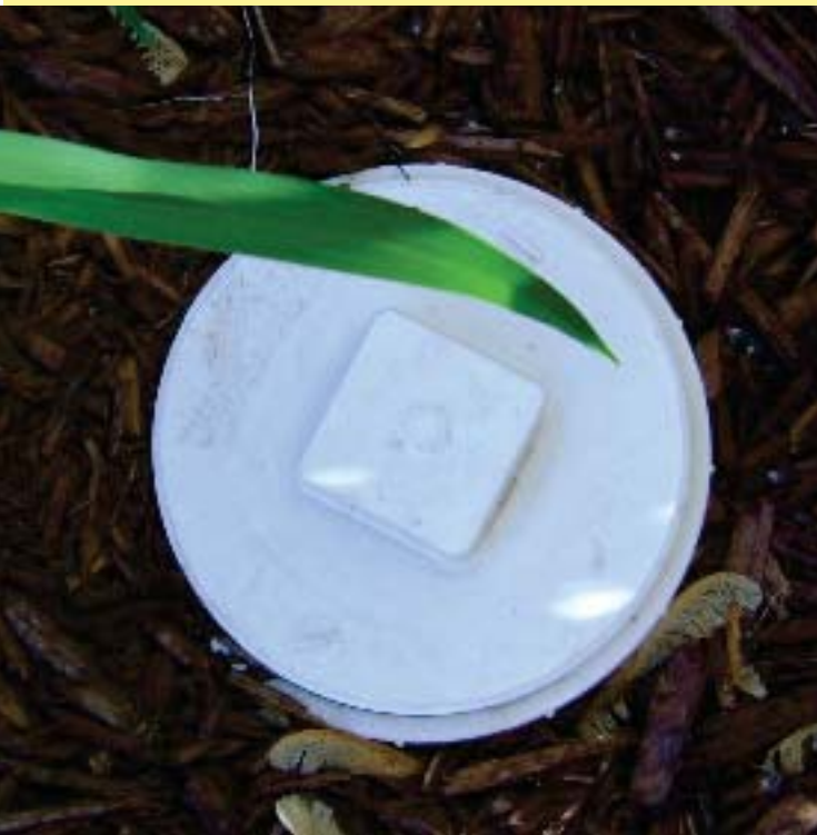
Typical sewer cleanout.

Inside this brochure you'll find an informative diagram showing the approximate location of the lateral in relation to your property line. Each home and property is unique, however, and conditions may vary. At a minimum, take this opportunity to find your particular property's sewer clean outs for future reference.