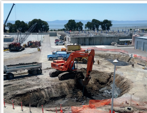
Excavation of Digester 6 (front) and Digester 7 (back)

The new digesters will also provide flexibility in plant operations when an existing digester needs to be maintained. The new digesters will incorporate fixed concrete covers, pumped mixing and withdrawal, and allow for grease receiving.