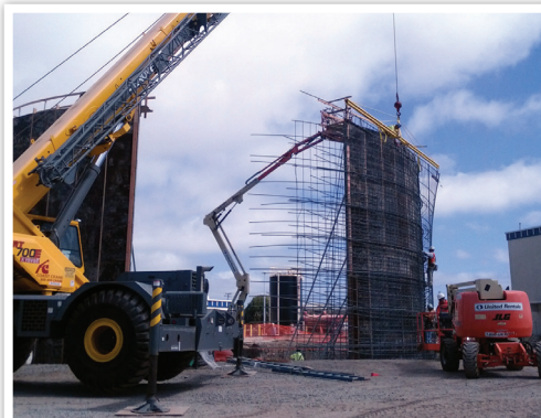
Installation of rebar cage for Digester 6 walls