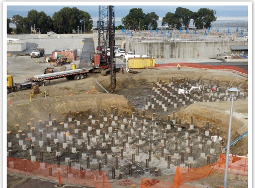
Installation of concrete piles with pile driving rig