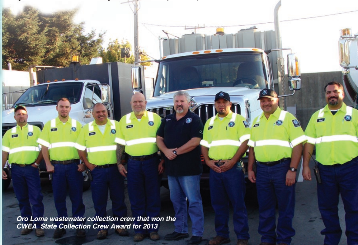
Oro Loma wastewater collection crew that won the CWEA State Collection Crew Award for 2013

Oro Loma achieved this high honor because of its drive to be the best, the ability to work together as a team, and willingness to practice, practice, practice to become the best it can be.