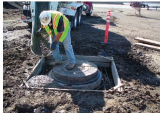
From the top: Pipe casings up to 60 inches were used to create a new crossing; A tunnel boring machine was used to excavate under I-880; New manholes were set to access the new sewer pipes.

The engineering staff is also preparing for the next round of pipeline replacements. The focus of this ongoing project is on pipelines in poor condition, those that require heavy maintenance, and pipelines crossing the Hayward fault.