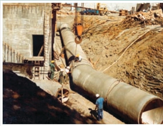
Construction of the EBDA main in 1975. The completed system was dedicated 1981.

The purpose of the "joint exercise of powers" agreement was to provide for more efficient disposal of wastewater by enabling member agencies to jointly construct common wastewater facilities. These facilities included pipelines, pump stations, a common submarine outfall, and a dechlorination station.