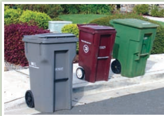
Clockwise from top left: Students and families celebrate at the 1999 Poster Contest Awards Ceremony; Installation of the belt press system; Incinerator that was used to burn dry sludge was demolished in 1999; Curbside recycling and trash pickup began in 1997; Sodium hypochlorite replaced chlorine in 1994.