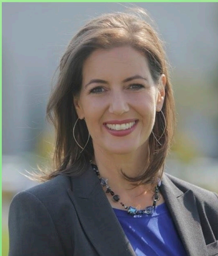
Opening remarks from Oakland Mayor Libby Schaaf

A townhall meeting on the need for a clean, reliable power grid, and the policies necessary to get there. Panel discussion followed by audience Q&A.