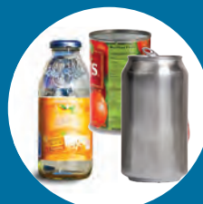
GLASS & METAL Food & beverage containers Must be empty