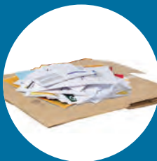
PAPER & CARDBOARD Must be dry & free of food