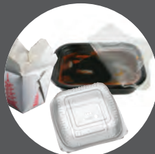
TO GO CONTAINERS & MICROWAVABLE FOOD TRAYS