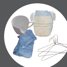
HOUSEHOLD ITEMS Hangers/wires (tangles), clothes, diapers/pet waste, toys, dishware & furniture