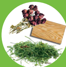
PLANT DEBRIS & UNTREATED/RAW WOOD