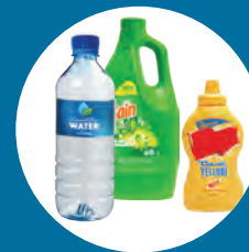
PLASTIC Hard containers / Size must be at least 4". Must be empty