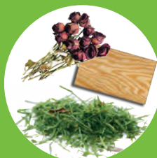
PLANT DEBRIS & UNTREATED/RAW WOOD