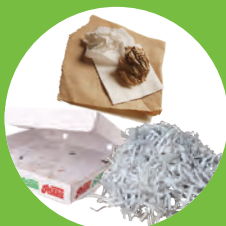
PAPER USED FOR FOOD OR DRINK