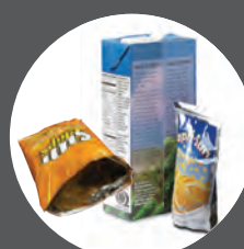
FOOD & DRINK PACKAGING