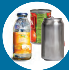
GLASS & METAL Food & beverage containers Must be empty