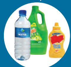
PLASTIC Hard containers / Size must be at least 4". Must be empty