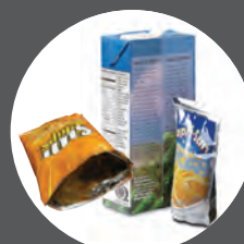
FOOD & DRINK PACKAGING