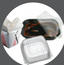
TO GO CONTAINERS & MICROWAVABLE FOOD TRAYS