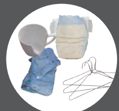
HOUSEHOLD ITEMS Hangers/wires (tangles), clothes, diapers/pet waste, toys, dishware & furniture