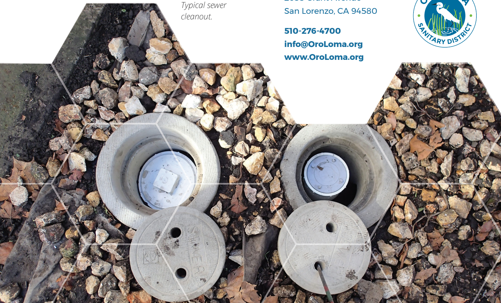
Typical sewer cleanout.

Here you will find a list of local contractors who regularly perform sewer lateral replacements in areas served by Oro Loma Sanitary District.