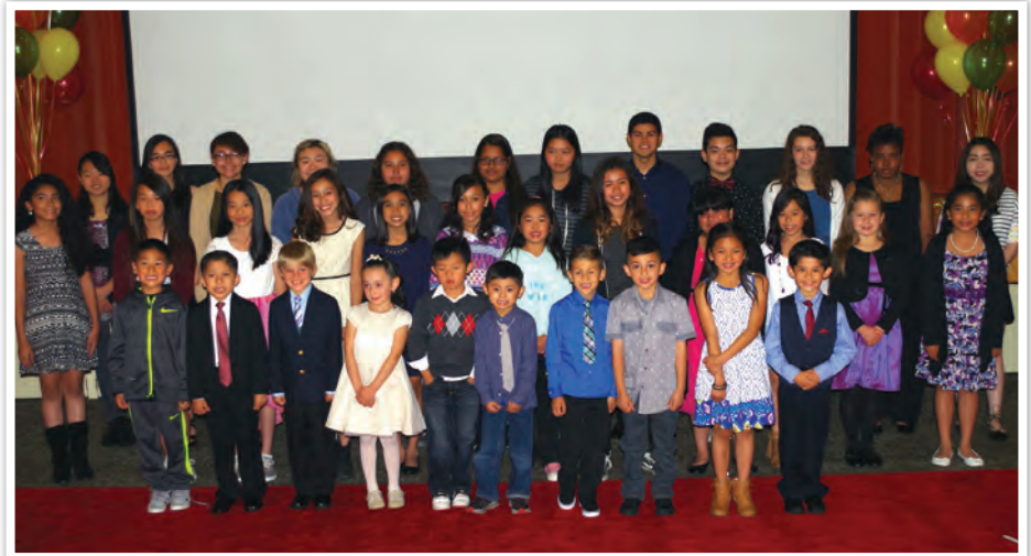
First Place, Second Place, Third Place, Honorable Mention, and Recycling Star winners of the 2016 poster contest

A complete list of winners with links to Recycling Star, First Place, Second Place, Third Place, and Honorable Mention posters can be found on www.oroloma.org .