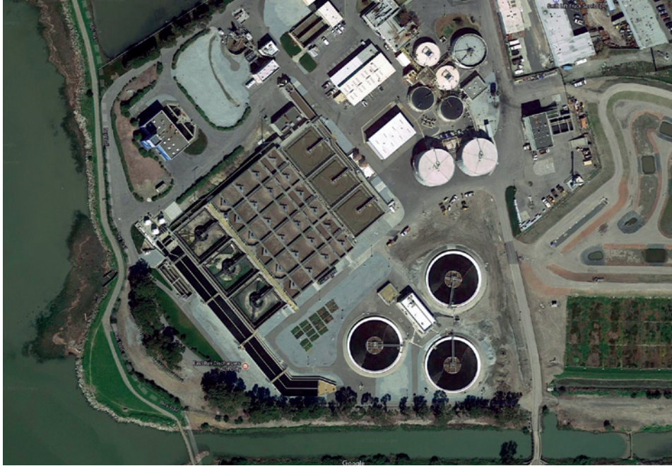
The Oro Loma/Castro Valley wastewater treatment plant