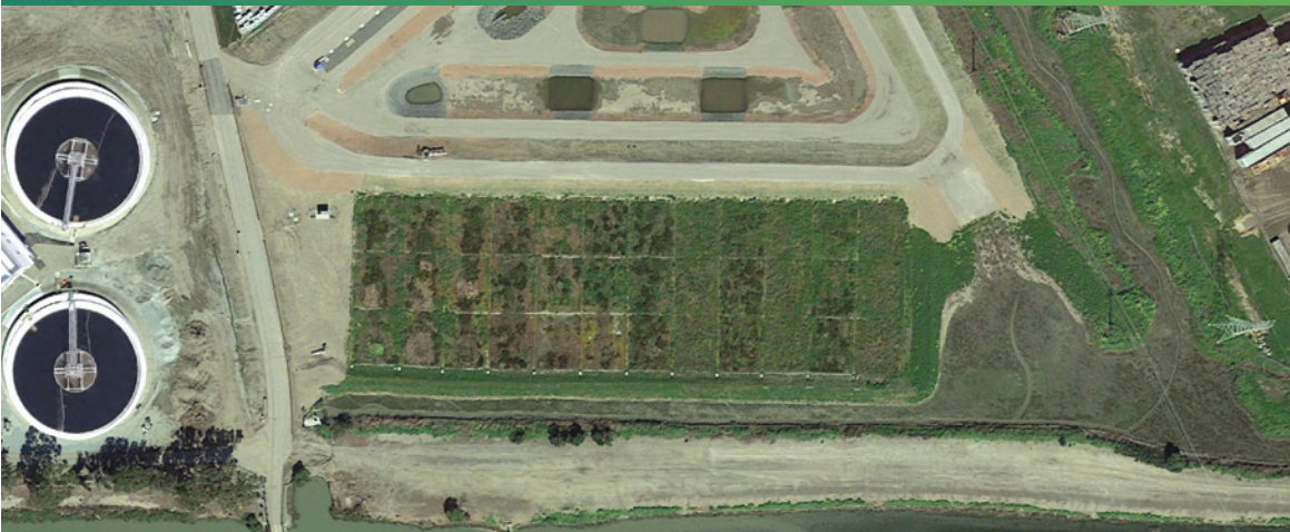
Horizontal levee with 8-million gallon equalization basin behind it.