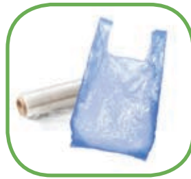
Flimsy plastics go in the trash.

State law requires jurisdictions to recycle at least 50% of what would otherwise go to landfill. For more than 10 years, Oro Loma has exceeded that goal.