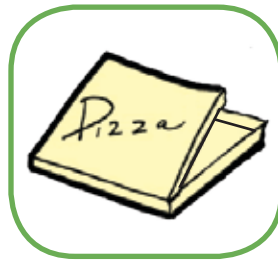
Pizza boxes go in organics.