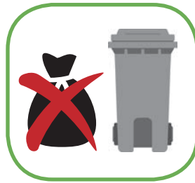
Don't bag recyclables!