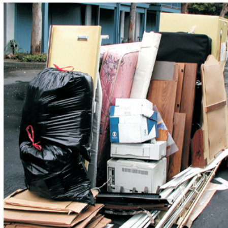
Oro Loma single-family residential customers are entitled to two free bulky pickups a year.