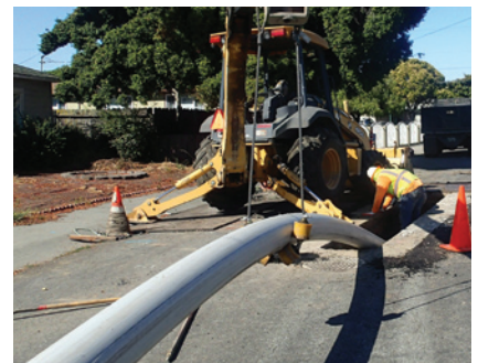
Staff is charged with improving the overall health of the sewer system.

Customer communication - Data from a recent survey shows that some customers are unsure about what