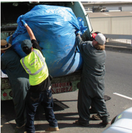
The whole community suffers when illegal dumping is allowed to continue.

large appliances, trash, and small appliances are among the items accepted. Items over 75 lbs., hazardous waste, and rocks, dirt, concrete or construction debris are not accepted. To schedule your bulky pickup, call Waste Management at least two weeks in advance at (510) 613-8710. You will receive a postcard in the mail confirming the date of your bulky pickup. More information is available at oroloma.org/bulky-waste-pickup/ .