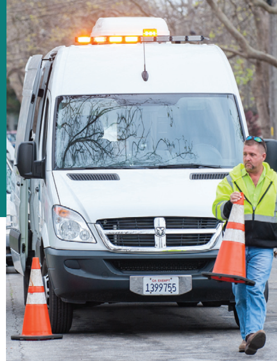
The new CCTV van

A hydro jetter does a great job cleaning pipes, but it also uses a lot of water and puts wear and tear on the system. Was it possible that some lines were being cleaned that did not need immediate