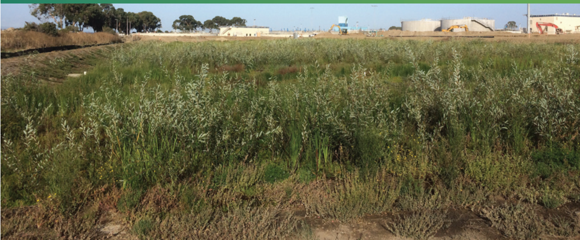
Native wetland plants and reeds are flourishing on the Oro Loma horizontal levee.