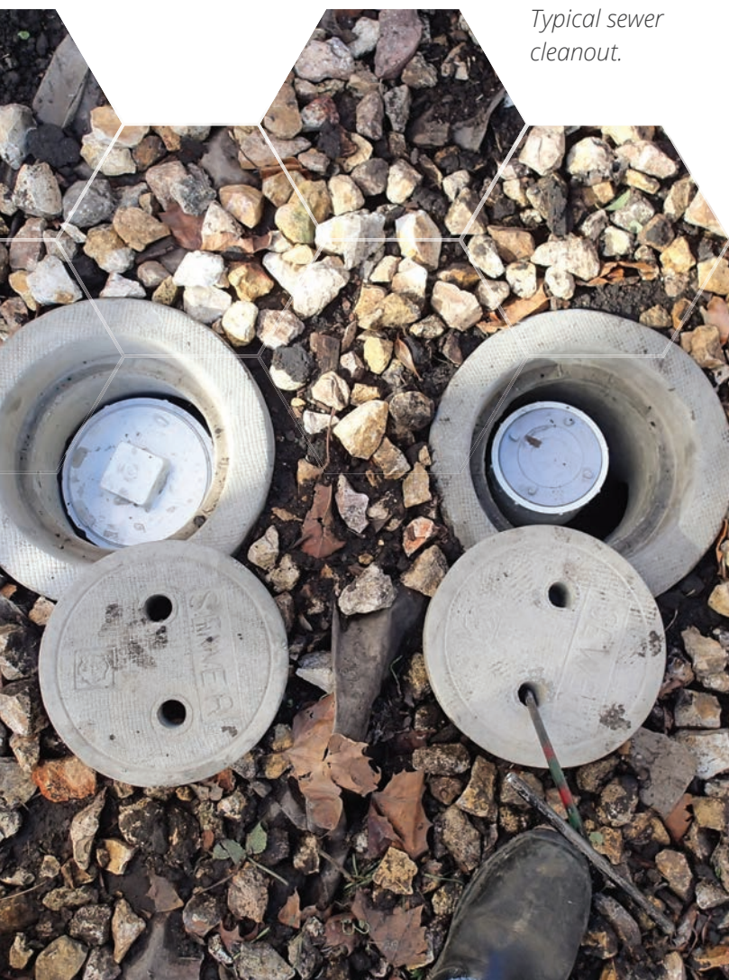
Typical sewer cleanout.

Inside this brochure you'll find an informative diagram showing the approximate location of the lateral in relation to your property line. Each property is unique and conditions may vary. At a minimum, take this opportunity to find your property's sewer cleanouts for future reference.