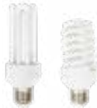
Compact Florescent Light (CFL)