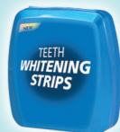
Whitening Strips & their Wrappers