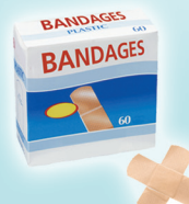
Bandages & Sticker backs