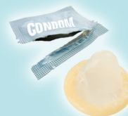
Condoms & their Wrappers