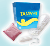
Tampons, Applicators, & Pads