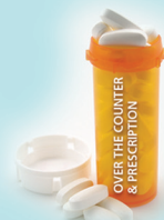
Prescription & OTC Medications