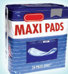
Maxi Pads & their Wrappers