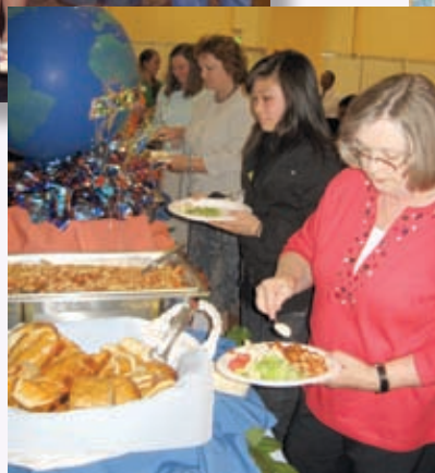
Students didn't learn what prize they had won until the awards ceremony.